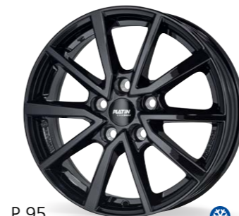
P 95 diamond black 16–17 inch