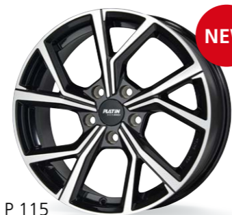
P 115 black, polished 16–18 inch