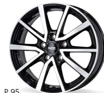
P 95 black, polished 16–17 inch