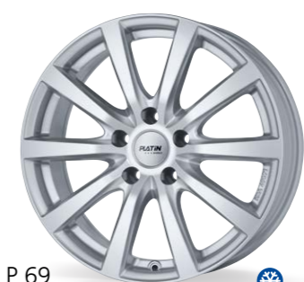
P 69 silver 15–18 inch

❄️ These wheels are suitable for winter use by special multilayer coatings