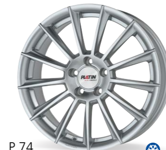
P 74 silver 17–19 inch