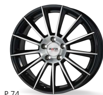
P 74 black, polished 17–19 inch