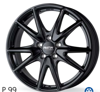
P 99 black glossy 17–19 inch