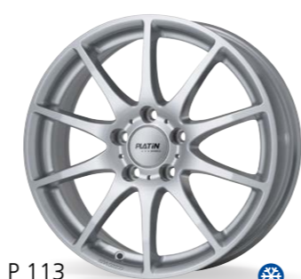
P 113 silver 16–18 inch