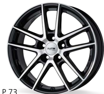
P 73 black, polished 14–18 inch