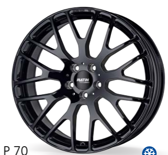
P 70 black shiny 17–21 inch