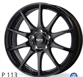
P 113 black 16–20 inch