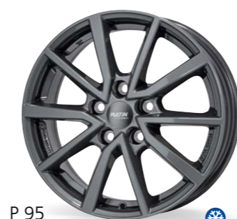
P 95 dark grey 16 inch