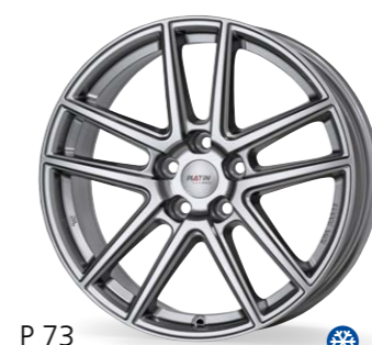
P 73 metallic silver 18–19 inch