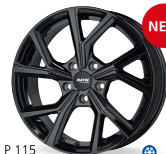
P 115 black shiny 16–18 inch