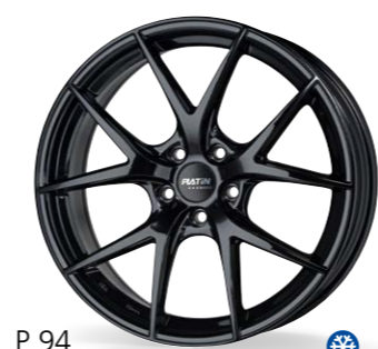
P 94 black 18–20 inch