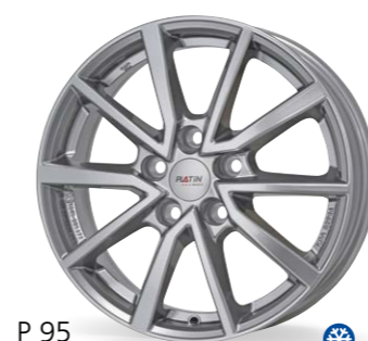
P 95 metal silver 16–17 inch