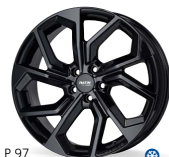
P 97 black glossy 16–20 inch