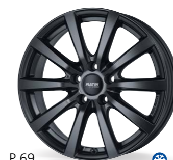
P 69 black mat 15–18 inch